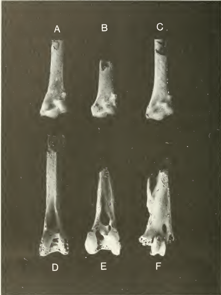
Fig. 3. Button-quail and kingfishers from Langebaanweg. A-C. Distal ends of right humeri of Turnix in palmar view ( \times 3 ). A. Turnix hottentotta nana (CM 1160). B. Fossil Turnix cf. T. hottentotta (L43366A). C. Turnix sylvatica lepurana (USNM 429079). D-F. Leg elements of kingfishers ( \times 4 ). D. Distal end of right tibiotarsus of Halcyon sp. (L24593H), anterior view. E. Distal end of left tibiotarsus of Ceryle sp. (L24001JR), anterior view. F. Distal end of right tarsometatarsus of Ceryle sp. (L24000FL), posterior view.

Early Pliocene, Varswater Formation: Quartzose Sand Member.